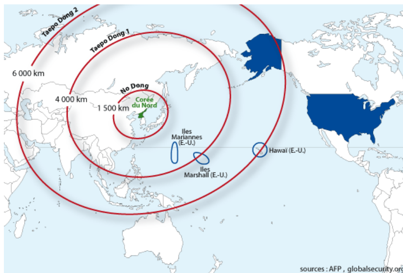
Figure 2: Map of area within range of North Korea's Taepo-Dong 2 missiles

Arabia for one has taken matters into its own hands by courting Russia via close arms cooperation. 33