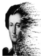
Carl von Clausewitz The enemy's Centre of Gravity is '... the hub of all power and movement, on which everything depends. That is the point against which all our energies should be directed.'

gence and information sharing has become even more important. Dedicated mechanisms for the exchange of information are required. Prevention, response to crisis and recovery measures need effective procedures to follow.